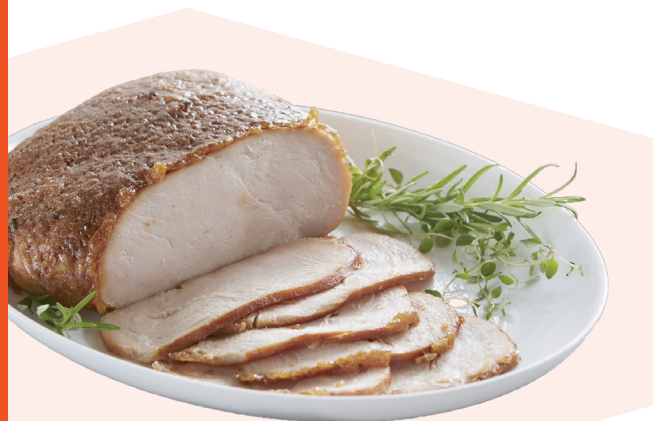
HONEY BAKED TURKEY BREAST